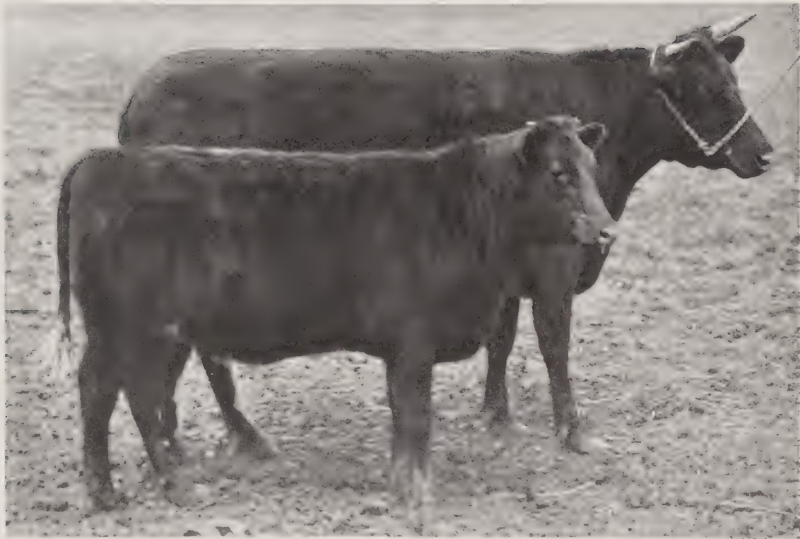
COLUMBIA 12TH AND HEIFER CALF.